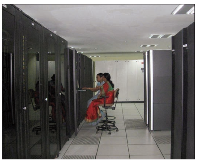
Inside the Data Centre